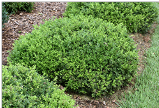
Tide Hill Boxwood