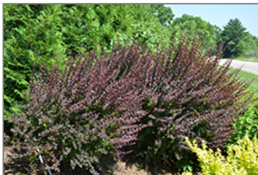
Sunjoy Syrah Japanese Barberry