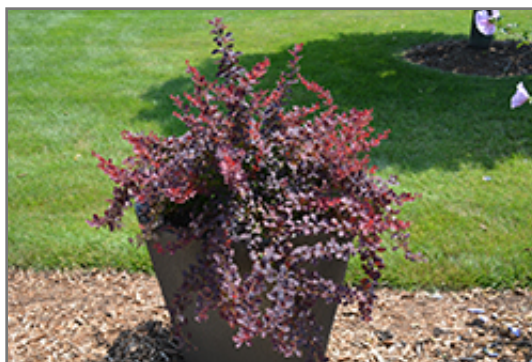
Sunjoy Syrah Japanese Barberry in bloom