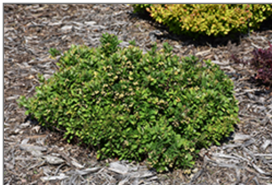
Moscato Barberry