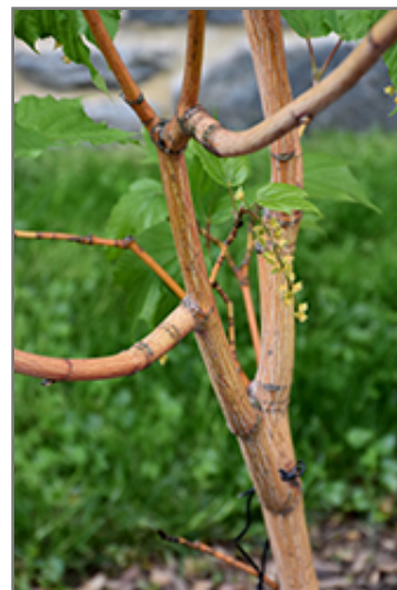
Phoenix Snakebark Maple bark

Phoenix Snakebark Maple will grow to be about 20 feet tall at maturity, with a spread of 20 feet. It has a low canopy with a typical clearance of 4 feet from the ground, and is suitable for planting under power lines. It grows at a slow rate, and under ideal conditions can be expected to live for 60 years or more.