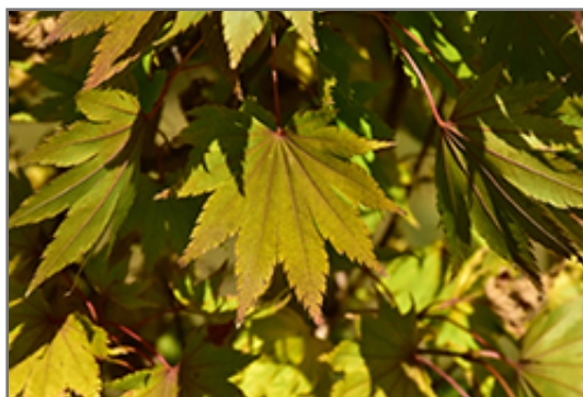
Jordan Full Moon Maple foliage