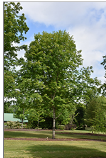
John Pair Sugar Maple