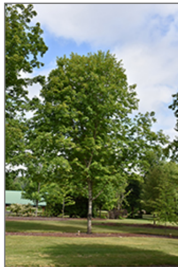
John Pair Sugar Maple