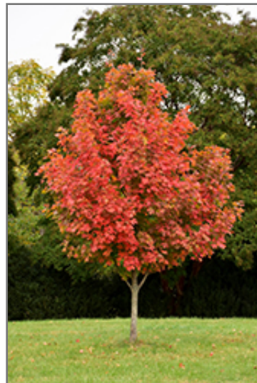
John Pair Sugar Maple in fall