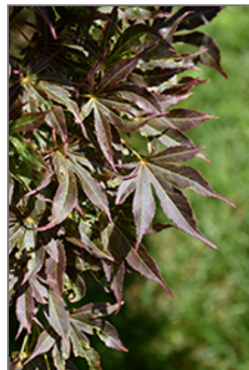
Tsukushi Gata Japanese Maple foliage