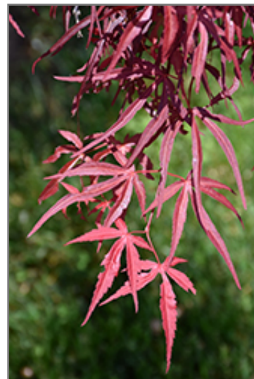
Red Spider Japanese Maple foliage