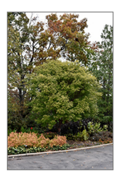
Girard's Hybrid Paperbark Maple

This tree does best in full sun to partial shade. It prefers to grow in average to moist conditions, and shouldn't be allowed to dry out. It is not particular as to soil type or pH. It is somewhat tolerant of urban pollution. This particular variety is an interspecific hybrid.