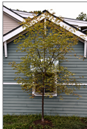
Cinnamon Girl Paperbark Maple in fall