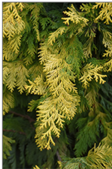
Cripps Gold Falsecypress foliage