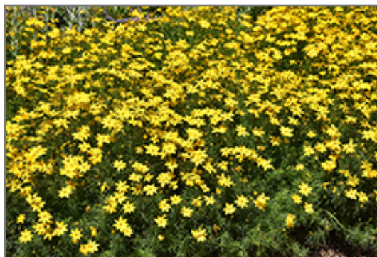
Golden Showers Tickseed in bloom