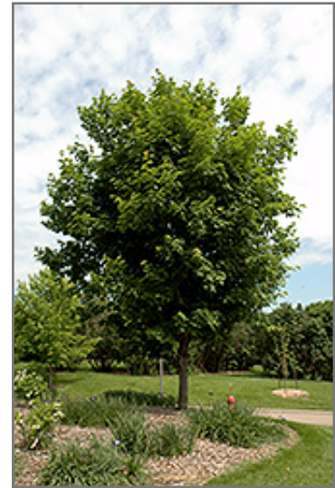
Sugar Maple

This tree should only be grown in full sunlight. It prefers to grow in average to moist conditions, and shouldn't be allowed to dry out. It is not particular as to soil pH, but grows best in rich soils. It is somewhat tolerant of urban pollution. This species is native to parts of North America.