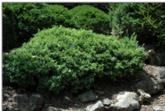
Grace Hendrick Phillips Boxwood