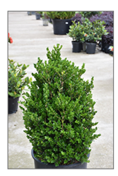
Faulkner Boxwood