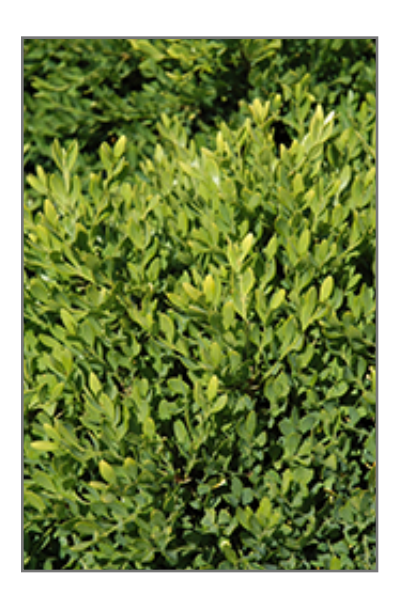
Faulkner Boxwood foliage