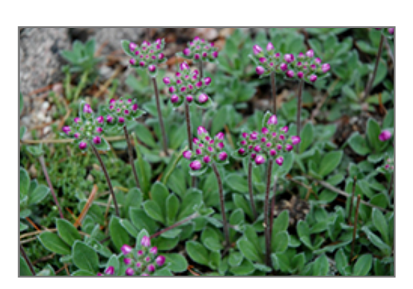
Rock Jasmine flowers

This alpine selection forms a mat of fuzzy green foliage creating a soft texture; produces dark violet-pink flowers with yellow centers; a nice addition to the garden or rockery