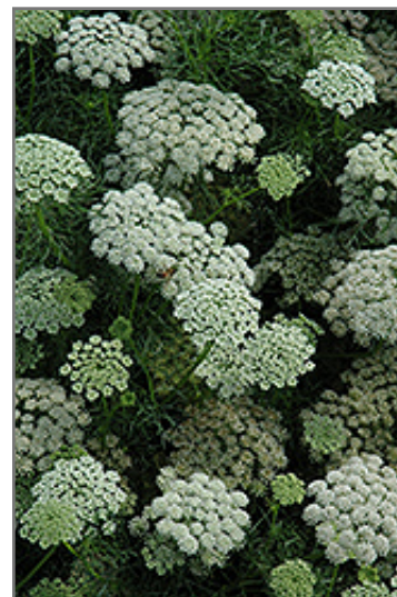
Green Mist Queen Anne's Lace flowers