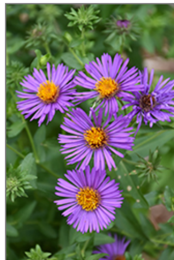
Purple Beauty Aster flowers