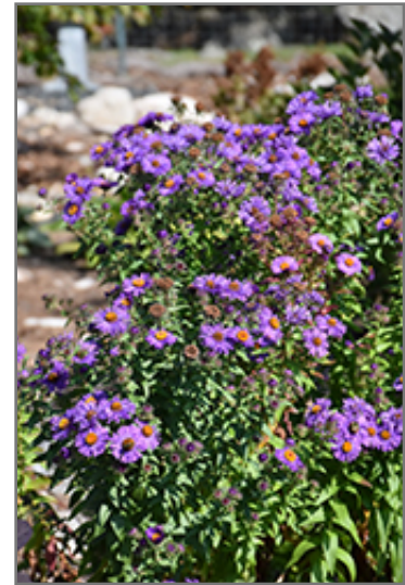
Purple Beauty Aster flowers

This plant does best in full sun to partial shade. It prefers to grow in average to moist conditions, and shouldn't be allowed to dry out. It is not particular as to soil type or pH. It is somewhat tolerant of urban pollution. This is a selection of a native North American species. It can be propagated by division; however, as a cultivated variety, be aware that it may be subject to certain restrictions or prohibitions on propagation.