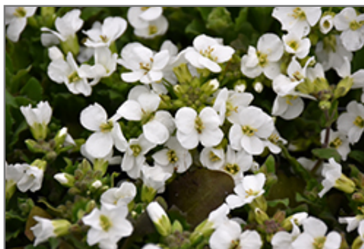
Snowcap Wall Cress flowers