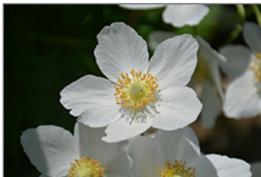
Windflower flowers

Windflower is recommended for the following landscape applications;