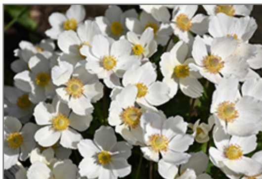
Windflower flowers