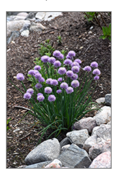
Chives in bloom