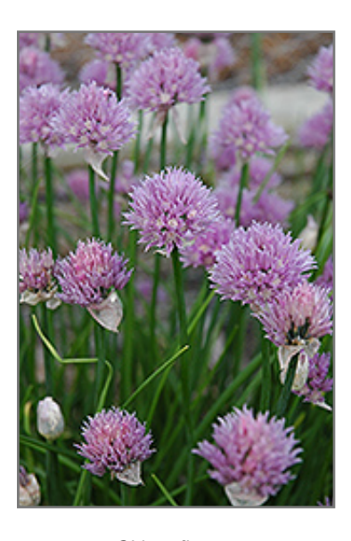
Chives flowers

Chives has masses of beautiful balls of lightly-scented lavender flowers at the ends of the stems from late spring to early summer, which are most effective when planted in groupings. Its grassy leaves remain green in color throughout the season. The green fruits are held in abundance in spectacular clusters from mid spring to late summer.