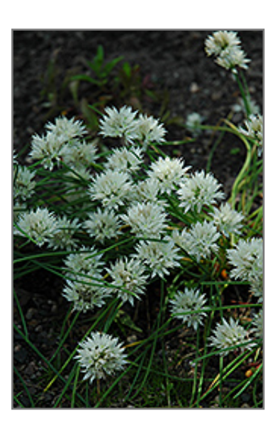
White Ornamental Onion flowers

Beautiful clusters of lightly scented, small white flowers bloom from late spring into early summer; unlike other selections, this narrow, grassy foliage stays throughout most of the summer months; a lovely addition to containers, borders and garden beds