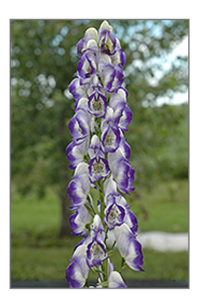
Bicolor Monkshood flowers

A highly toxic, upright perennial that presents hooded white and indigo, bi-colored flowers and dark green ferny foliage; lovely accent for containers and garden beds; prune after flowering; should not be grown around children or in vegetable gardens