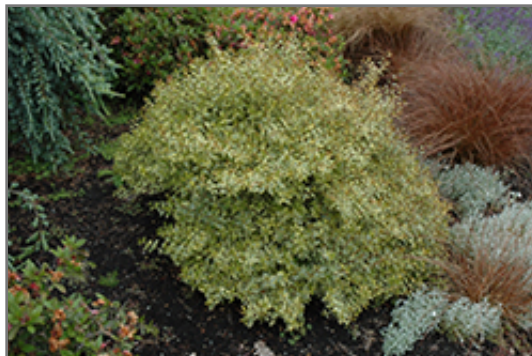
Sunrise Abelia

Sunrise Abelia is recommended for the following landscape applications;