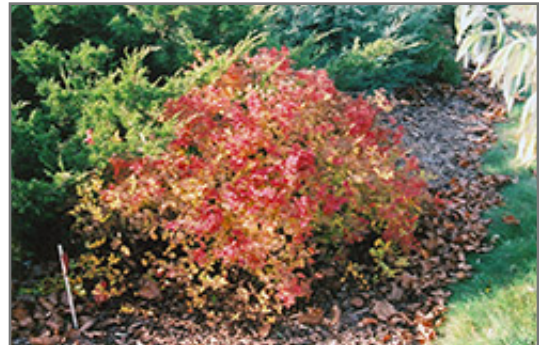
Golden Princess Spirea in fall

Golden Princess Spirea will grow to be about 3 feet tall at maturity, with a spread of 4 feet. It tends to fill out right to the ground and therefore doesn't necessarily require facer plants in front. It grows at a fast rate, and under ideal conditions can be expected to live for approximately 20 years.