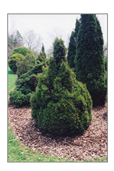
Brabant Arborvitae

Brabant Arborvitae will grow to be about 12 feet tall at maturity, with a spread of 5 feet. It tends to fill out right to the ground and therefore doesn't necessarily require facer plants in front, and is suitable for planting under power lines. It grows at a slow rate, and under ideal conditions can be expected to live for 40 years or more.