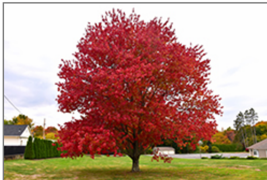
Red Maple in fall