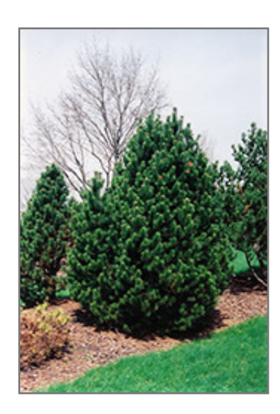
Gnom Mugo Pine

Gnom Mugo Pine will grow to be about 4 feet tall at maturity, with a spread of 5 feet. It tends to fill out right to the ground and therefore doesn't necessarily require facer plants in front. It grows at a slow rate, and under ideal conditions can be expected to live for 50 years or more.