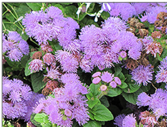
Artist Alto Blue Flossflower flowers