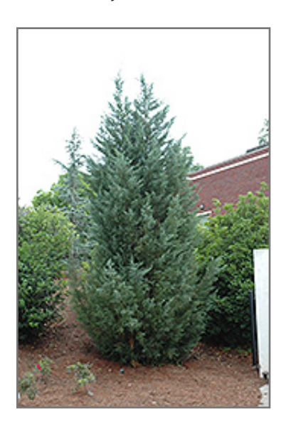
Burk's Redcedar