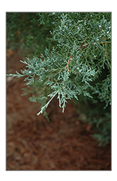
Burk's Redcedar foliage