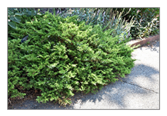
Buffalo Juniper

A common groundcover evergreen for home landscape and garden use; consistent bright green foliage all season long, low growing, wide spreading and densely branched, forms a mound; excellent in massing and groupings or as a groundcover