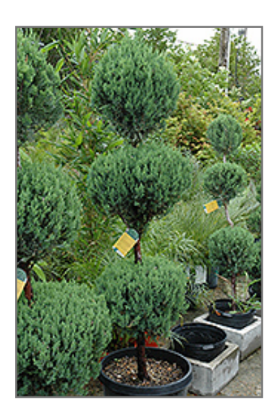
Blue Point Juniper (topiary form)

This shrub should only be grown in full sunlight. It is very adaptable to both dry and moist growing conditions, but will not tolerate any standing water. It is not particular as to soil type or pH. It is highly tolerant of urban pollution and will even thrive in inner city environments. This is a selected variety of a species not originally from North America.