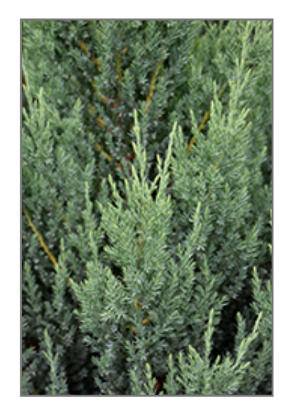
Blue Point Juniper foliage