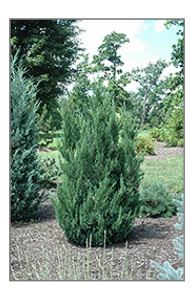
Blue Point Juniper