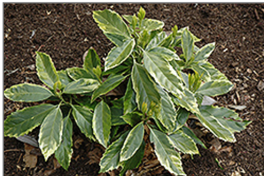
Limbata Aucuba

Limbata Aucuba will grow to be about 10 feet tall at maturity, with a spread of 6 feet. It has a low canopy, and is suitable for planting under power lines. It grows at a fast rate, and under ideal conditions can be expected to live for approximately 20 years.