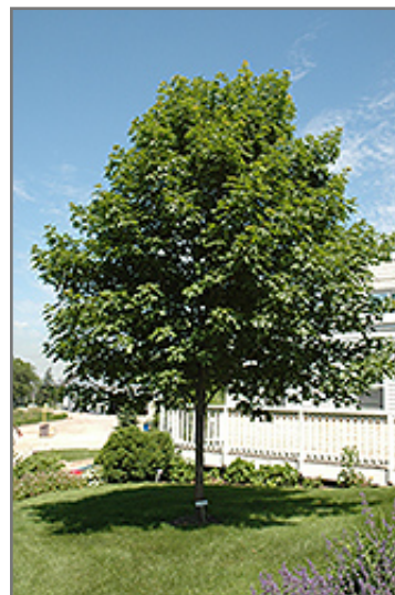
Fall Fiesta Sugar Maple

This tree should only be grown in full sunlight. It prefers to grow in average to moist conditions, and shouldn't be allowed to dry out. It is not particular as to soil pH, but grows best in rich soils. It is somewhat tolerant of urban pollution. This is a selection of a native North American species.