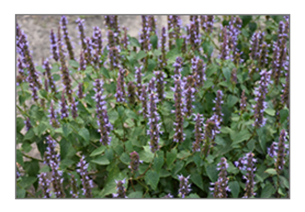
Little Adder Hyssop flowers

Easy-to-care for perennial flowers on airy spikes add lovely texture to any garden; radiant lavender-purple color; a favorite for butterflies and hummingbirds; soothing, aromatic, licorice scented foliage for the fragrant garden