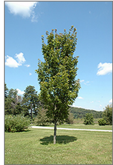
Red Rocket Red Maple

This tree should only be grown in full sunlight. It is quite adaptable, preferring to grow in average to wet conditions, and will even tolerate some standing water. It is not particular as to soil type, but has a definite preference for acidic soils, and is subject to chlorosis (yellowing) of the foliage in alkaline soils. It is somewhat tolerant of urban pollution. This is a selection of a native North American species.