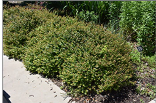
Rose Creek Abelia

Rose Creek Abelia makes a fine choice for the outdoor landscape, but it is also well-suited for use in outdoor pots and containers. Because of its height, it is often used as a 'thriller' in the 'spiller-thriller-filler' container combination; plant it near the center of the pot, surrounded by smaller plants and those that spill over the edges. It is even sizeable enough that it can be grown alone in a suitable container. Note that when grown in a container, it may not perform exactly as indicated on the tag - this is to be expected. Also note that when growing plants in outdoor containers and baskets, they may require more frequent waterings than they would in the yard or garden. Be aware that in our climate, this plant may be too tender to survive the winter if left outdoors in a container. Contact our experts for more information on how to protect it over the winter months.