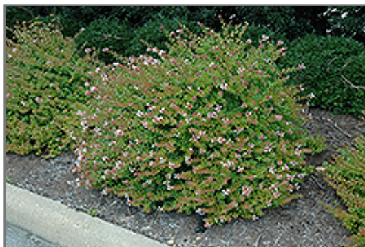
Rose Creek Abelia in bloom

Rose Creek Abelia is recommended for the following landscape applications;