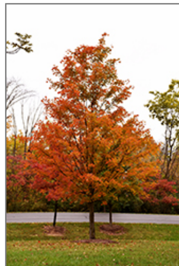
Norwegian Sunset Maple in fall