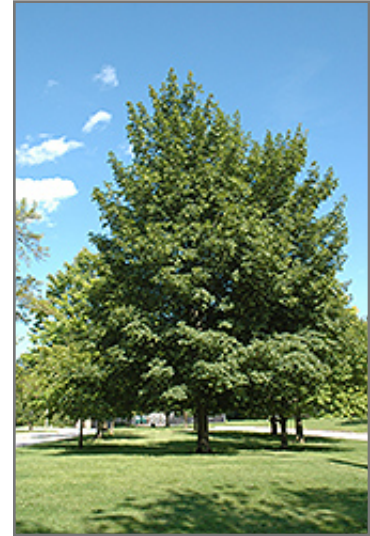
Norwegian Sunset Maple

This tree should only be grown in full sunlight. It is very adaptable to both dry and moist locations, and should do just fine under average home landscape conditions. It is not particular as to soil type or pH. It is highly tolerant of urban pollution and will even thrive in inner city environments. This particular variety is an interspecific hybrid.