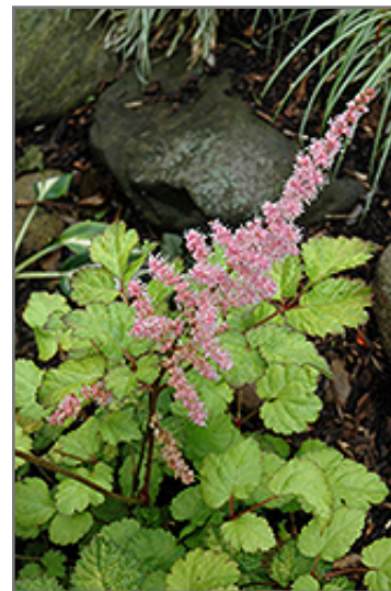
Amber Moon Chinese Astilbe flowers