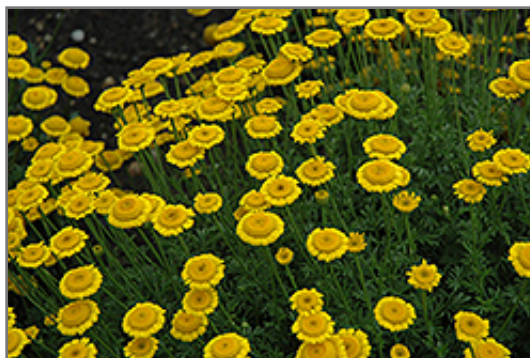
Charme Marguerite Daisy flowers