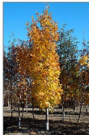
Lord Selkirk Sugar Maple in fall