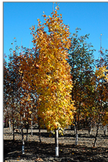
Lord Selkirk Sugar Maple in fall