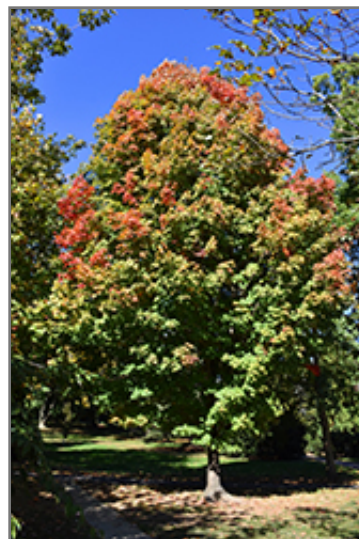
Endowment Sugar Maple