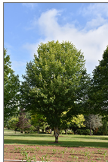
Belle Tower Sugar Maple