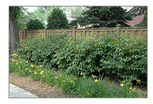
Fireglo Amur Maple

An outstanding ornamental shrub for smaller home landscapes; very slow growing with a dense mounded habit; colorful seeds in late summer and stunning scarlet fall color; perfect for the back of borders or screening