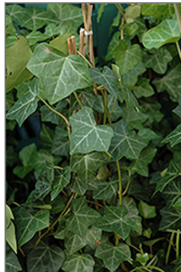
Thorndale Ivy foliage