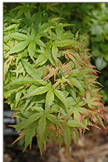
Sharp's Pygmy Japanese Maple foliage