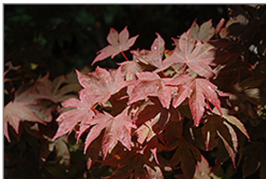
Ruslyn In The Pink Japanese Maple foliage

Ruslyn In The Pink Japanese Maple is recommended for the following landscape applications;