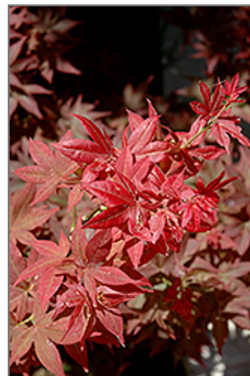
Ruby Stars Japanese Maple foliage