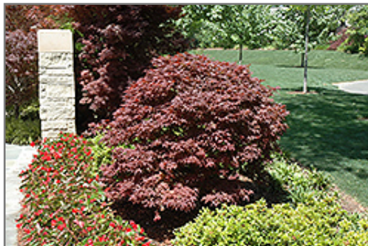
Rhode Island Red Japanese Maple