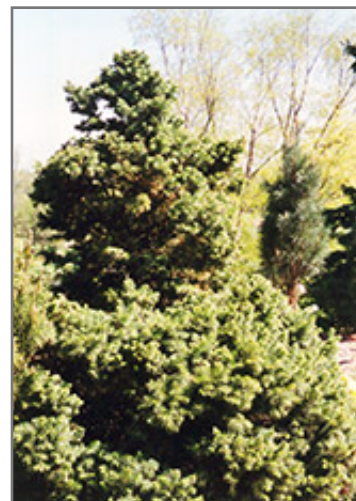
Green Globe Alpine Fir

Green Globe Alpine Fir will grow to be about 12 feet tall at maturity, with a spread of 10 feet. It tends to fill out right to the ground and therefore doesn't necessarily require facer plants in front, and is suitable for planting under power lines. It grows at a slow rate, and under ideal conditions can be expected to live to a ripe old age of 100 years or more; think of this as a heritage shrub for future generations!